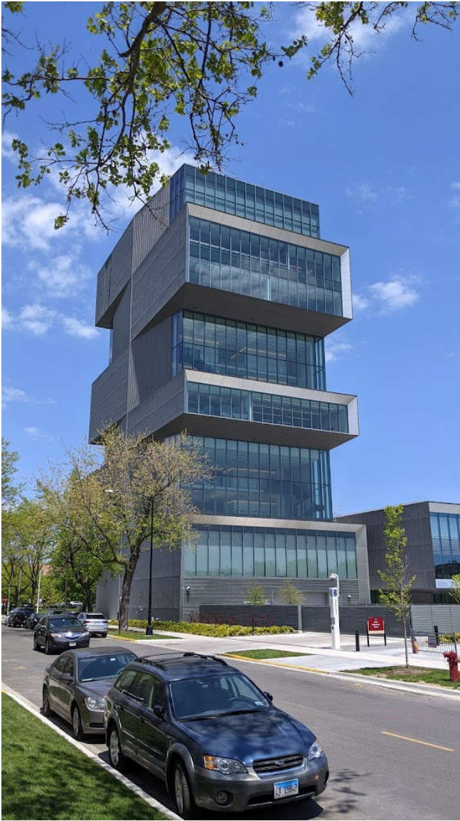
Exhibit Date: Saturday, February 24, 2024

Exhibit Location: David Rubenstein Forum